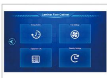
LCD Display 7-inch color touch screen, real-time display of running status.

E-mail: support@biobase.com www.biobase.cc / www.biobase.com