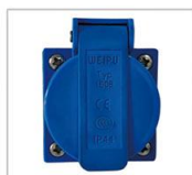
Waterproof Socket Optimum convenience of using small devices inside the cabinet.