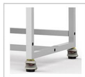
Foot-master Caster Universal aster with brake and leveling feet.